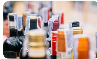
WINE & SPIRITS